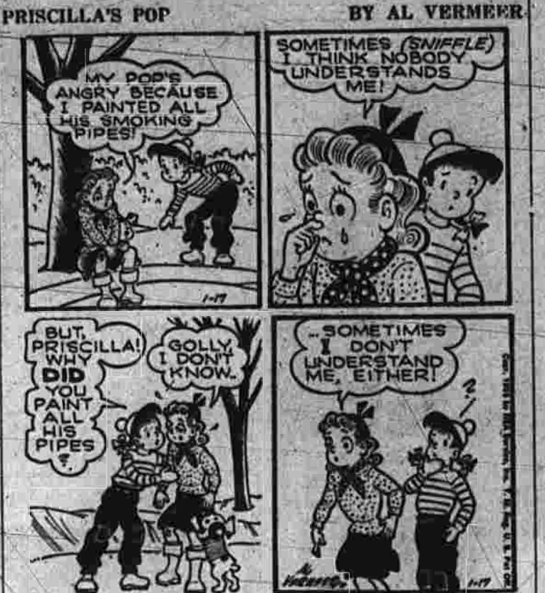
PRISCILLA'S POP BY AL VERREER